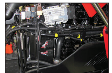
Engine – left side view

*mCRD™ Technology on 1533 and 1538 models.