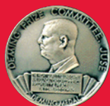
DEMING PRIZE 2003