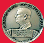
DEMING PRIZE 2003