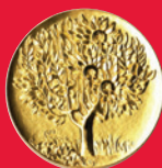
JAPAN QUALITY MEDAL 2007