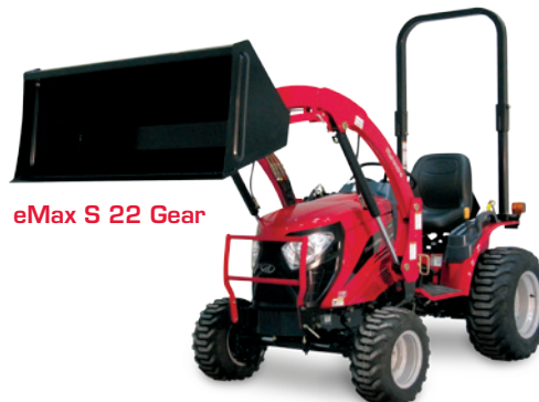
eMax S 22 Gear