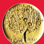
JAPAN QUALITY MEDAL 2007