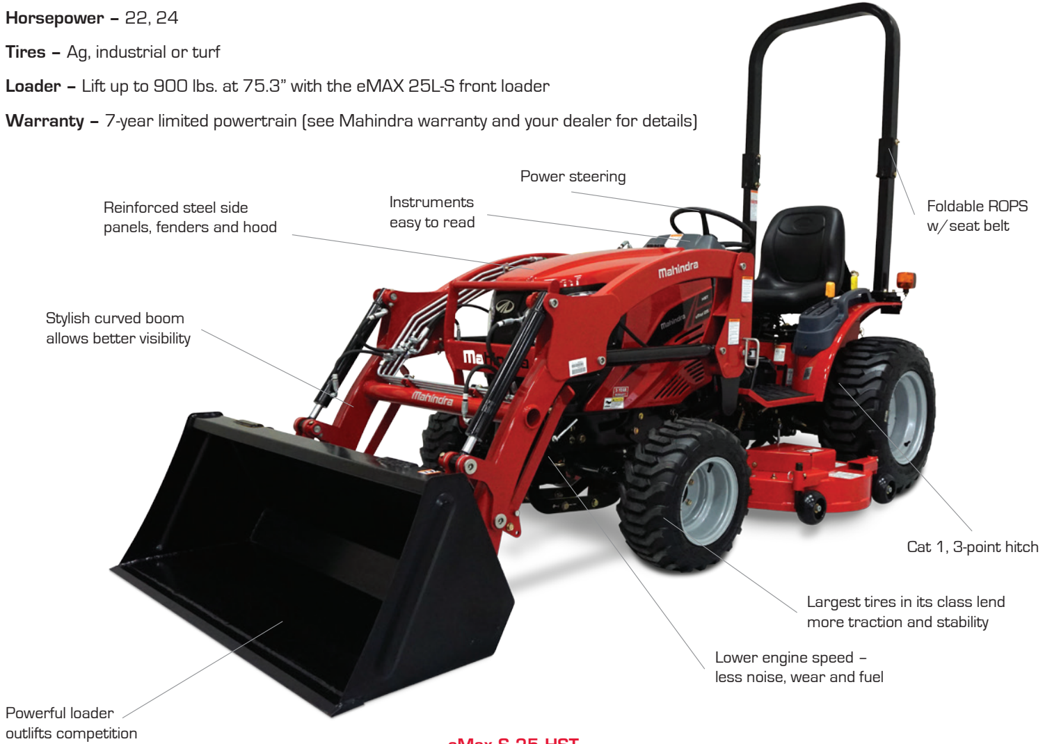
eMax S 25 HST

Warranty – 7-year limited powertrain (see Mahindra warranty and your dealer for details)