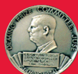
DEMING PRIZE 2003